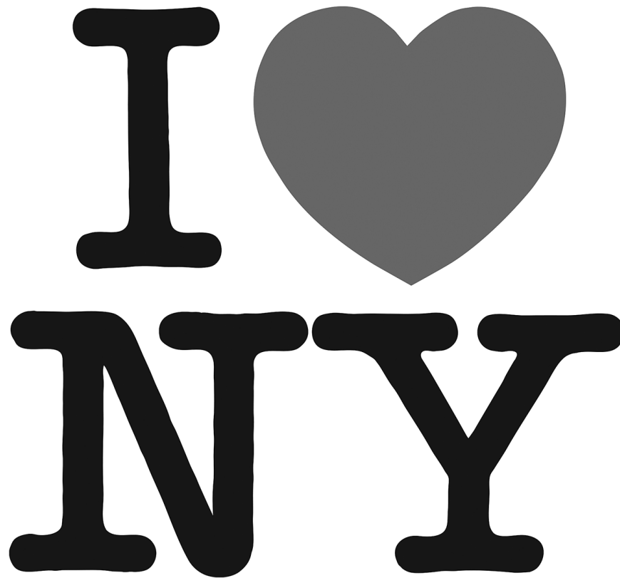
FIGURE 3. THE IMAGE BELOW DEPICTS THE MOST COMMON REPRESENTATION OF THE “I ♥ NY” TRADEMARK. 286