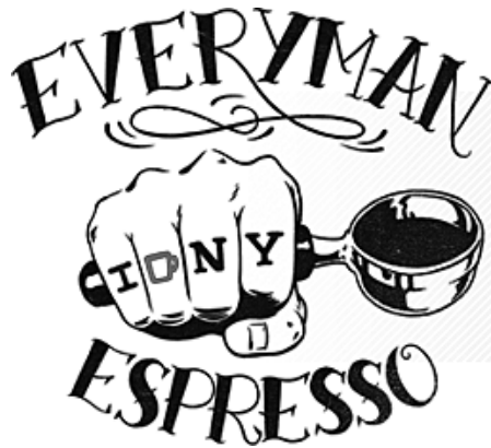
FIGURE 2. THE BELOW IMAGE DEPICTS SAM PENIX'S TATTOO. 285